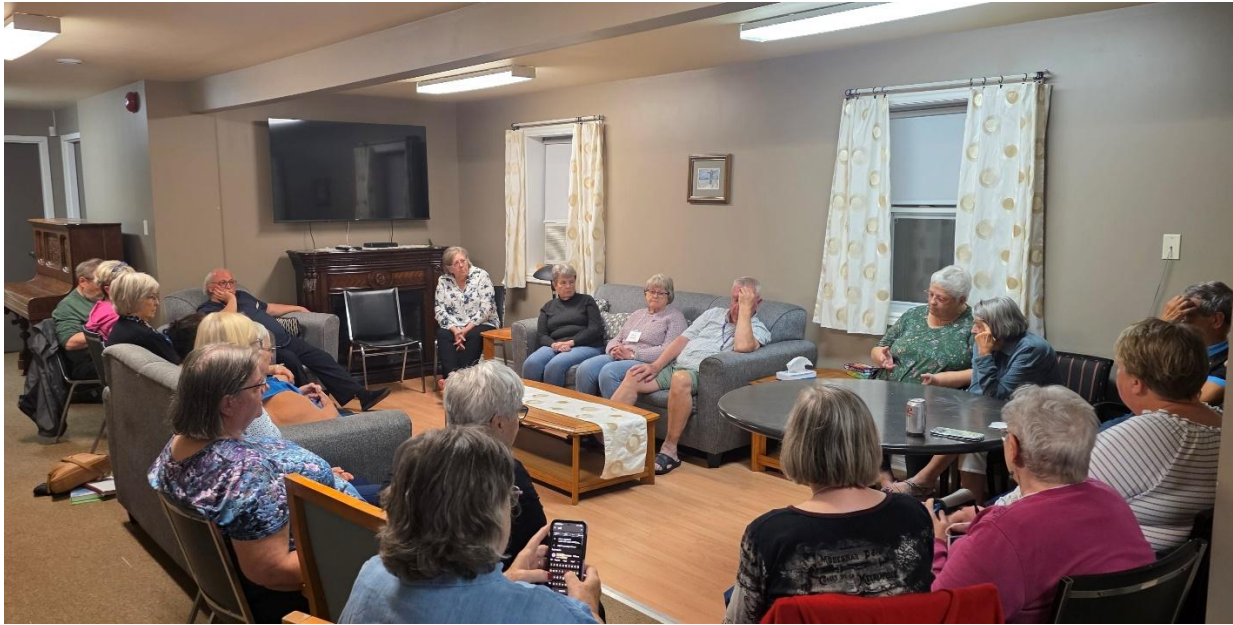
Taking time to relax after a full day.